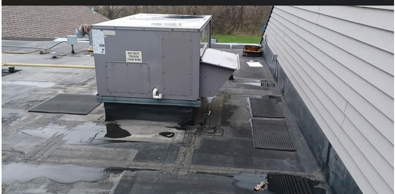
(Existing site photo #5)