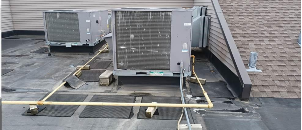
(Existing site photo #3)