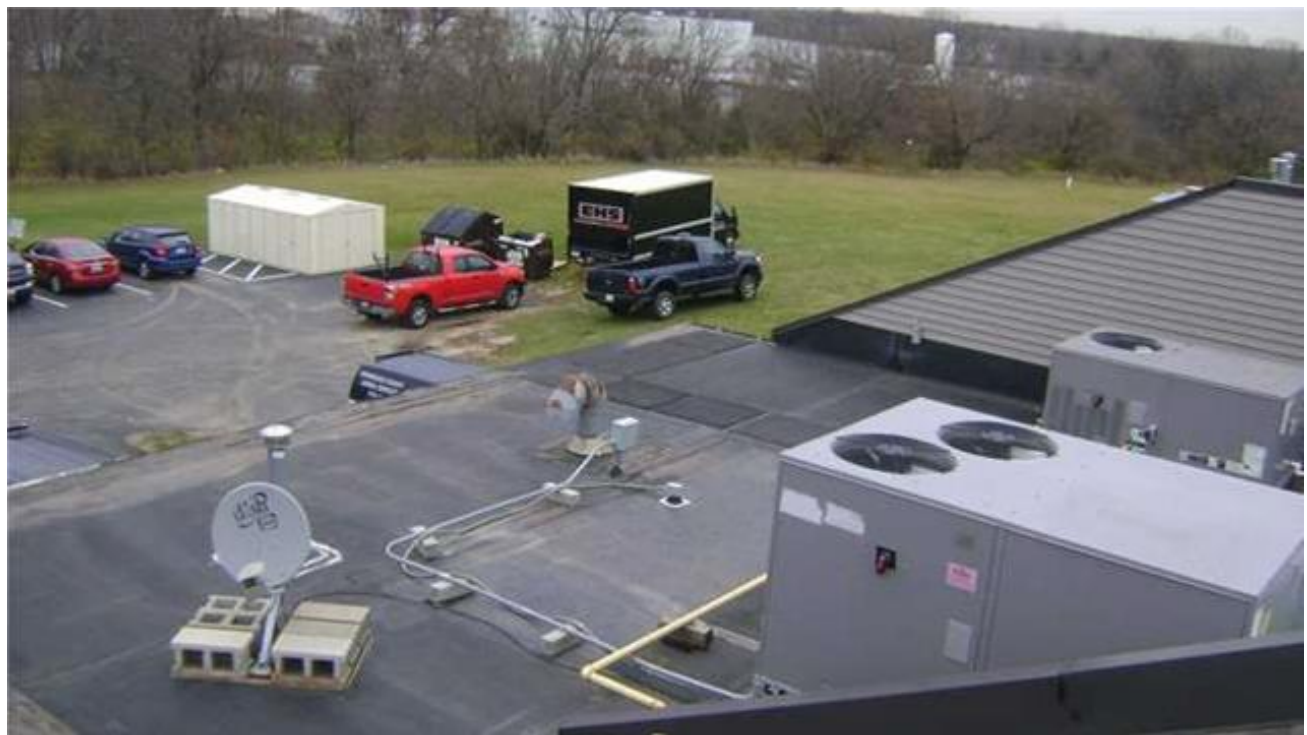
(Existing site photo #2)