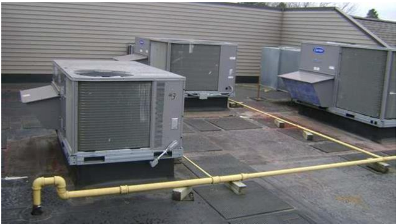
(Existing site photo #1)