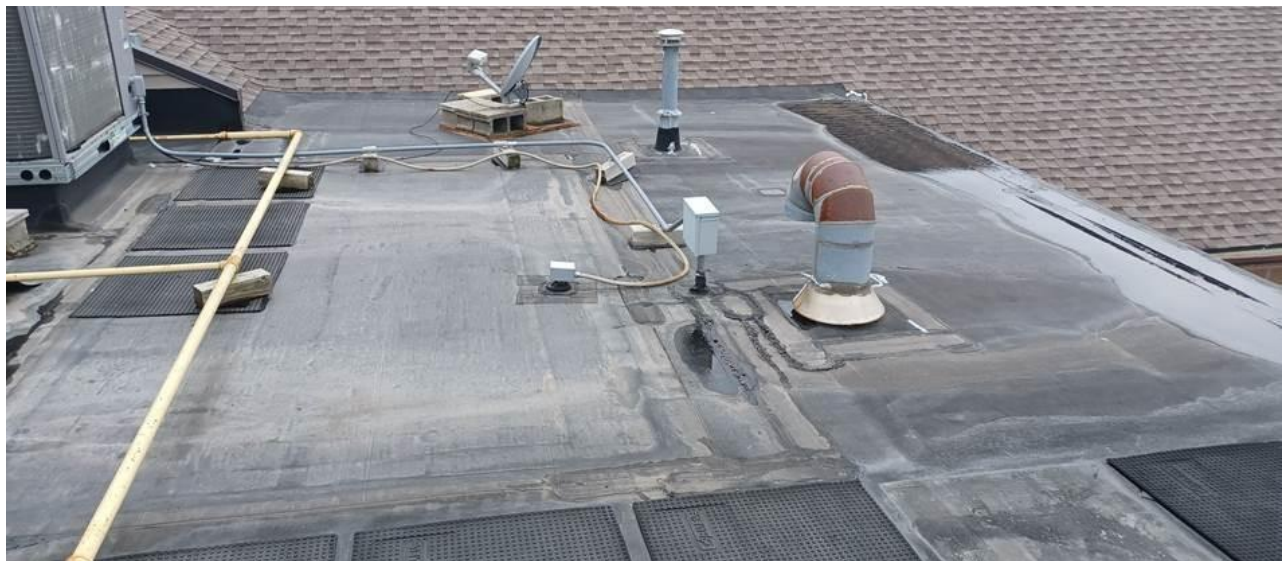
(Existing site photo #6)