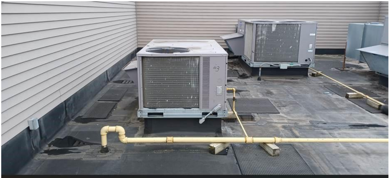
(Existing site photo #4)