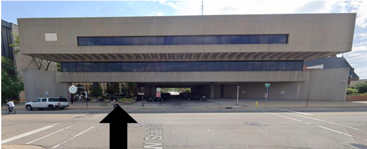
Entrance & Exit