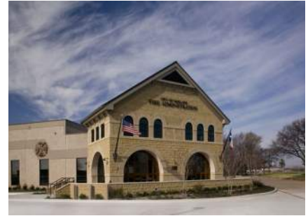
Fire Training Facility, Garland, TX