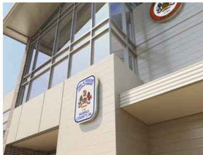
Fairfax County Fire/Rescue Training Academy Expansion, Fairfax, VA