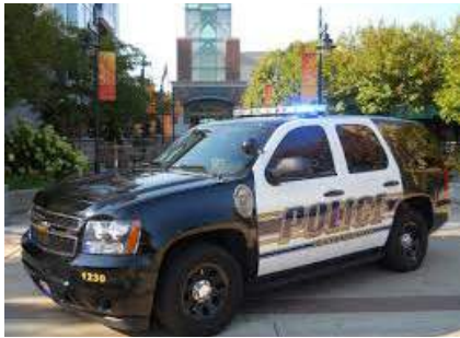
Public Safety Facility Building Needs Assessment, Fayetteville, AR