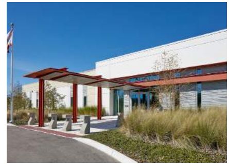
Hillsborough Public Safety Operations Complex, Tampa, FL