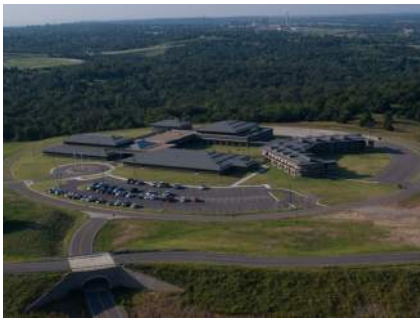
Training Center, Council on Law Enforcement Education and Training, Ada, OK