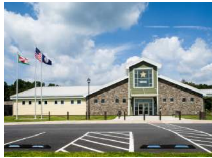
Western Loudoun Sheriff's Station, Round Hill, VA