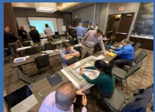
2019 IACP Police Facility Planning Workshop hosted by Dewberry

Being selected at the national level to participate in writing best practice standards, guidelines, or speaking and presenting at conferences is not easy – but we relish in going the extra mile. Competitive submission and selection processes are required in order to have a chance at presenting or being involved in writing best practices.