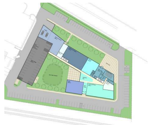
site study diagram #2

Dewberry was responsible for design of the new headquarters which accommodates all police department needs including a crime lab, crime scene vehicle processing, indoor garage for 27 vehicles, a community room, evidence processing, jail, prisoner processing, sally port, indoor firing range, as well as the area Emergency Operations Center.